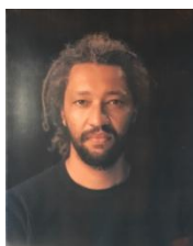
Alain GOMIS Senegal/France Filmmaker