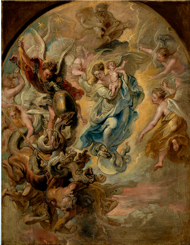
The Virgin as the Woman of the Apocalypse by Peter Paul Rubens

In terms of form this story can be read as an allegory of a toxic relationship, how love could change into a desire to control and dominate others.