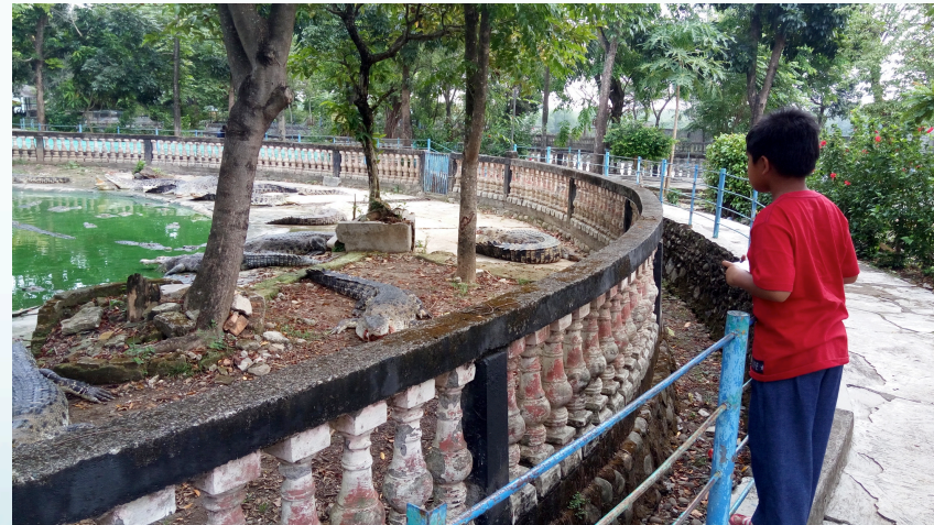
Indonesia Jaya Crocodile Park, Suka Ragam, Serang, Bekasi